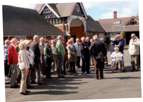
Friends assemble at Bletchley Park

The day included visits to the huts where it all happened, displays of wartime vehicles, model ships and Churchillian memorabilia. An intriguing day closed with welcome refreshments and much discussion of the way this secret establishment, and one unappreciated genius, contributed in the nick of time to winning World War 2.